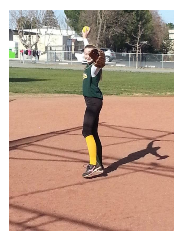
Keep ball out front of body, straight back, straight forward