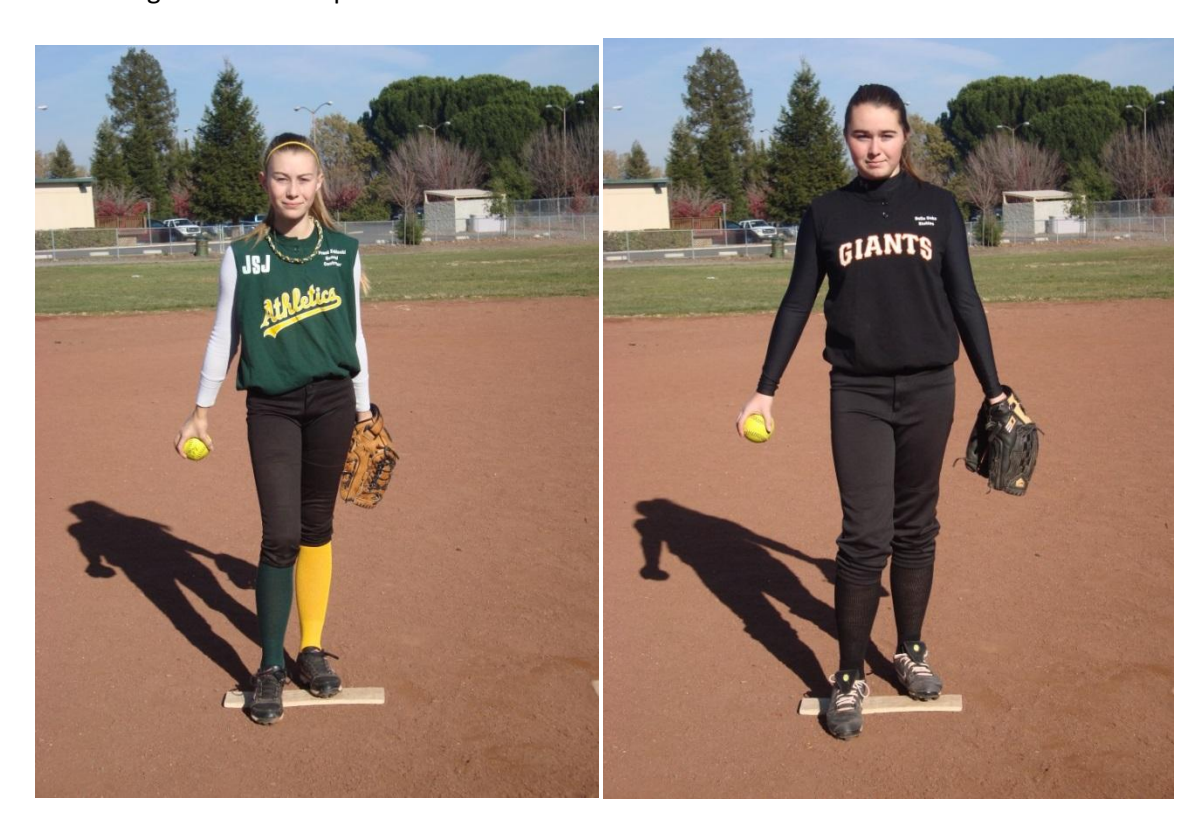
2 – Separate hands, weight on back foot.