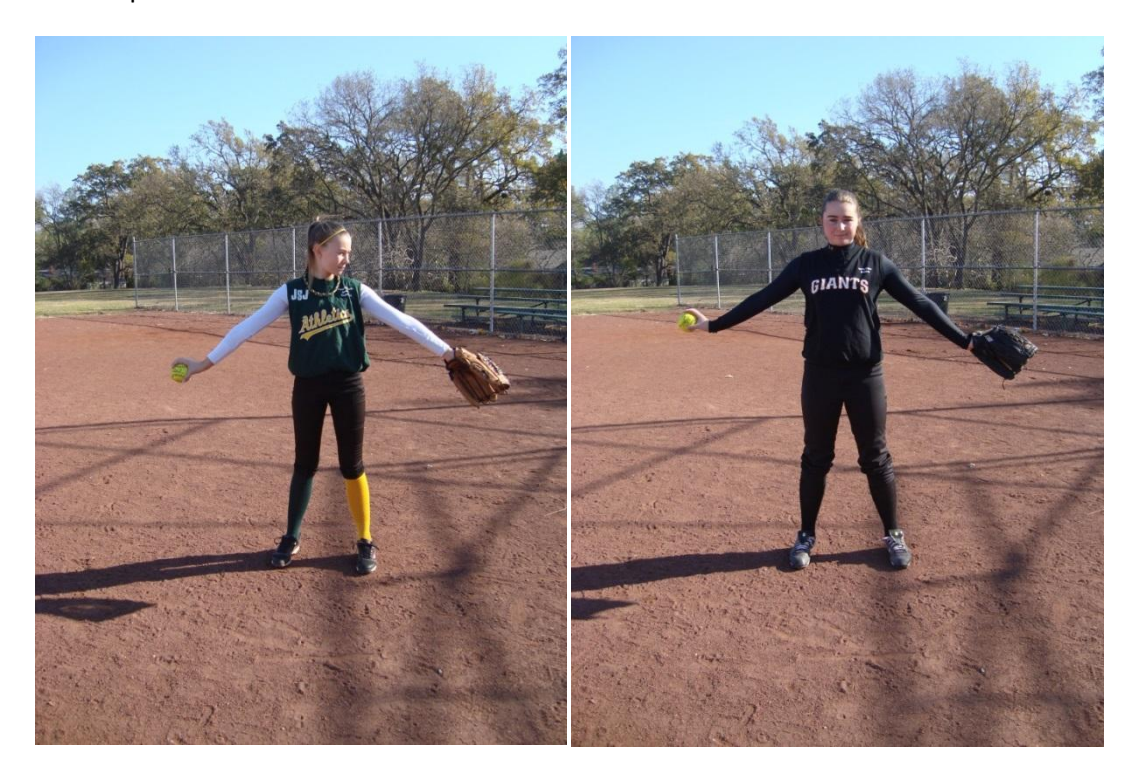
Pendulum – both arms even below waist, flip ball forward glove hand slaps thigh