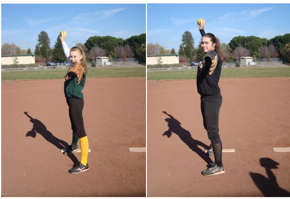
3 – Step and rotate plant foot (don't lift up or step with plant foot) – Power Position