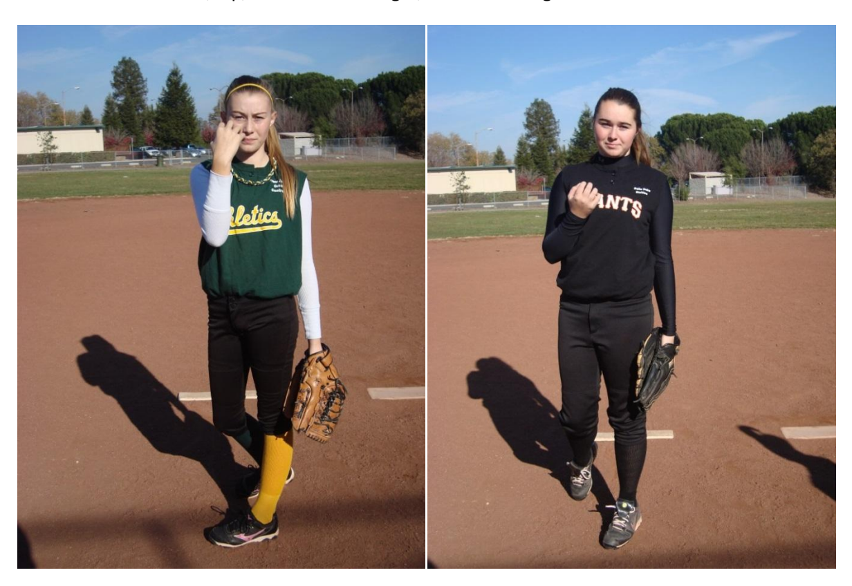
5 - Rotate hips after releasing for power