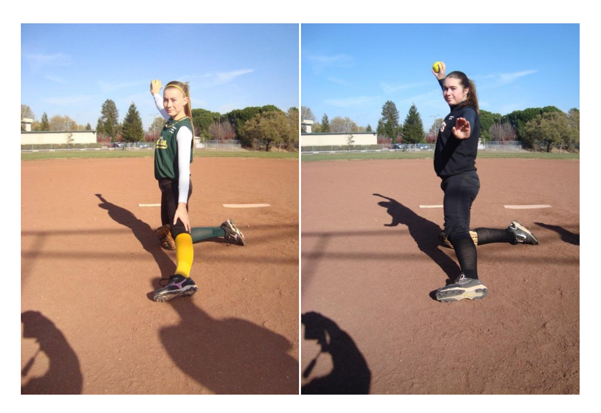
Down on one knee, front foot sideways (arm only motion)