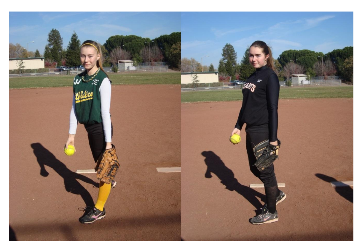
4 - Point front shoulder, hip, outer knee at target, when releasing ball