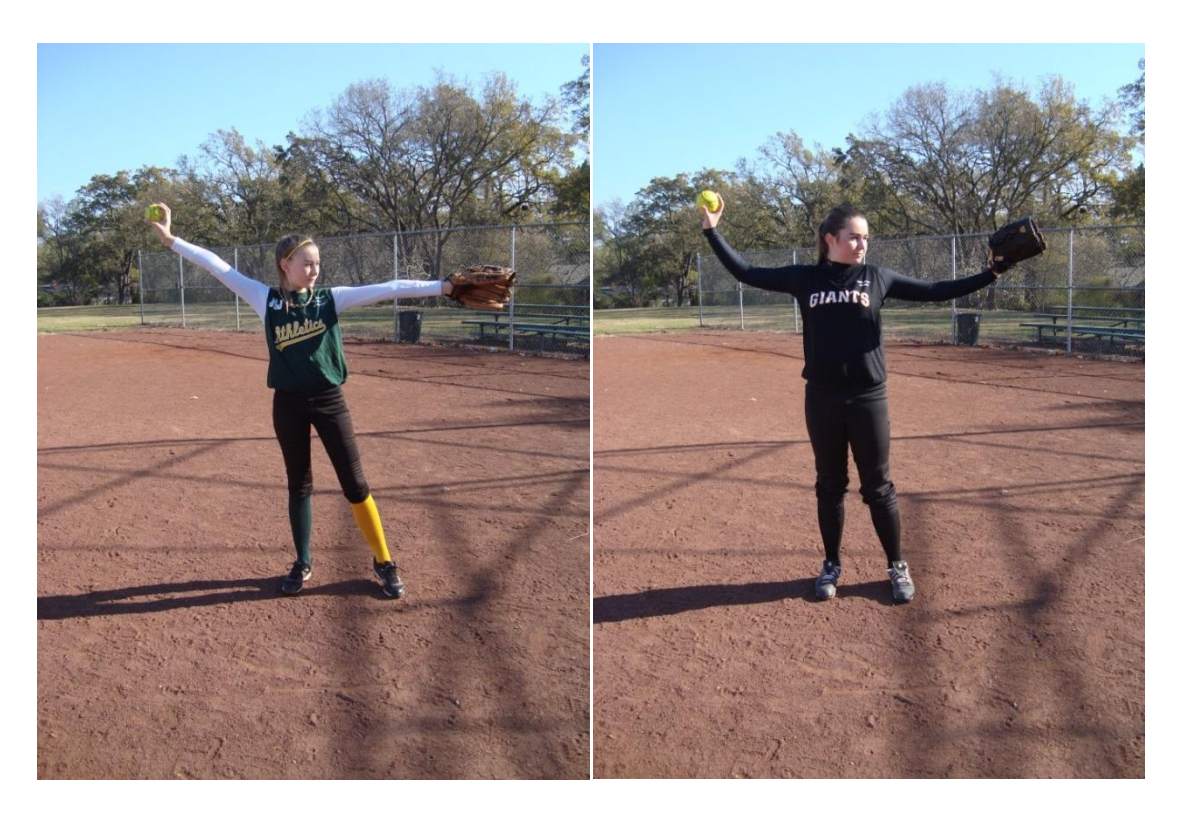
Same drill further away, arms go higher