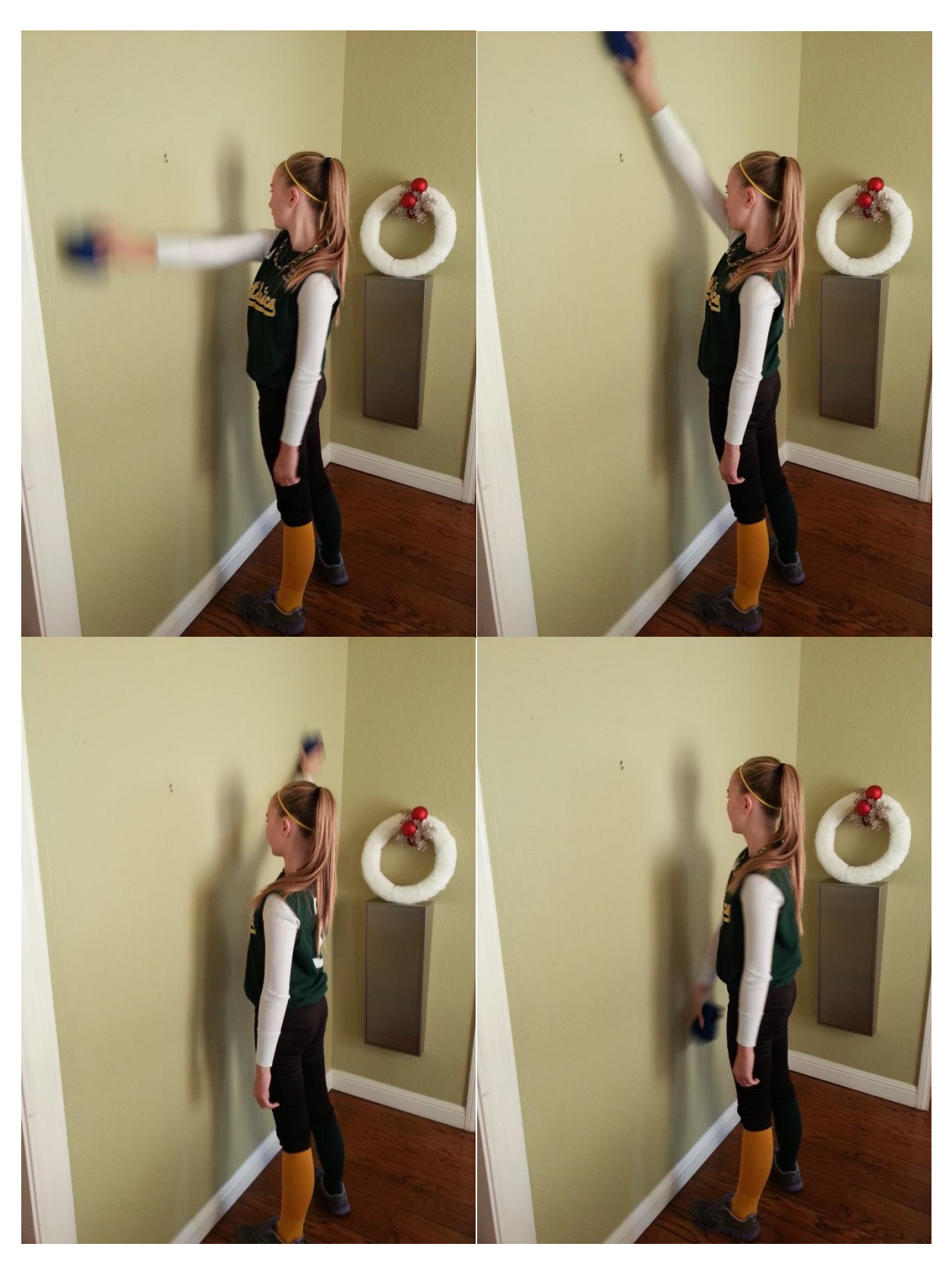
Sock on the wall practice, muscle memory for the arm circle, make big circles and keep the sock touching the wall at all times. Helpful when player is pulling arm behind head during circle motion.