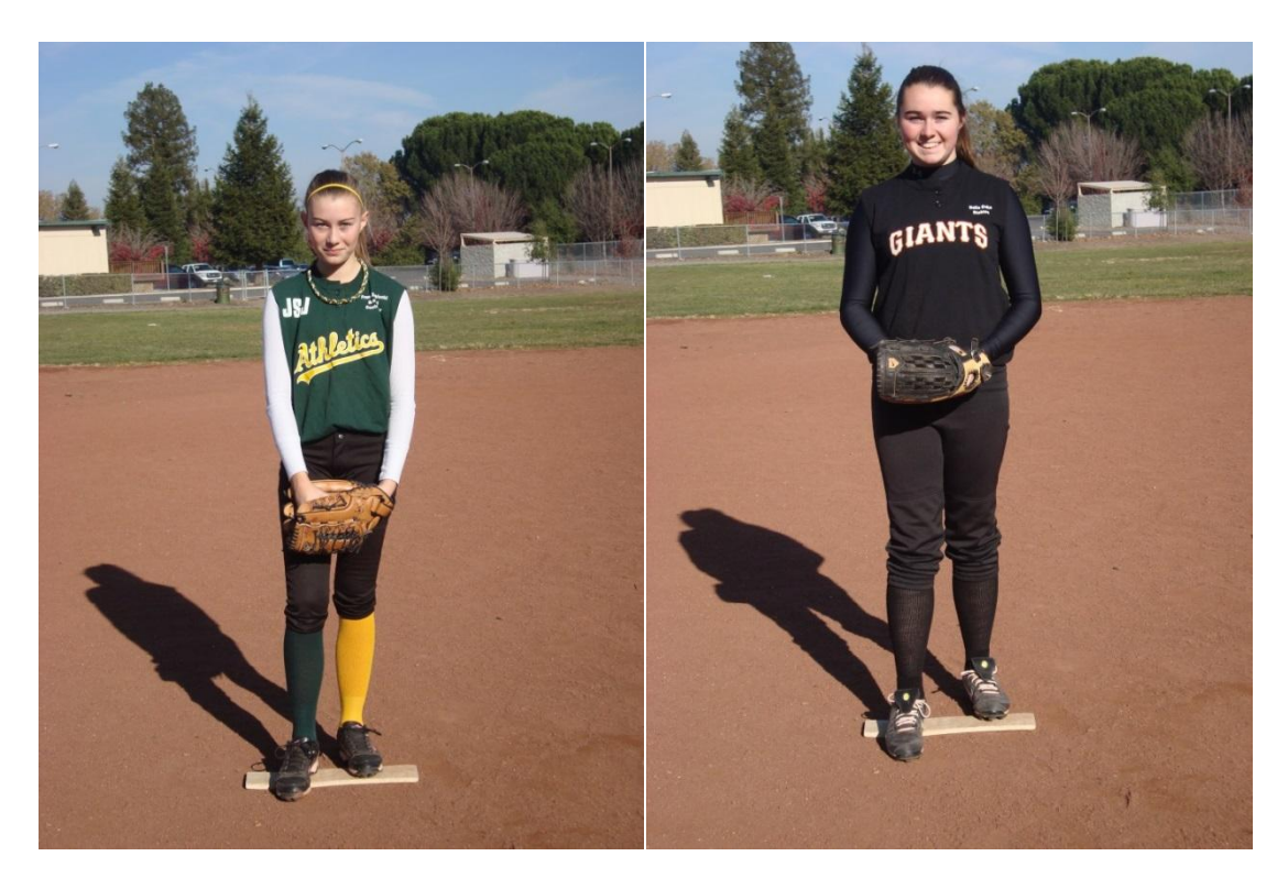
1 - Ball in glove. Don't step back